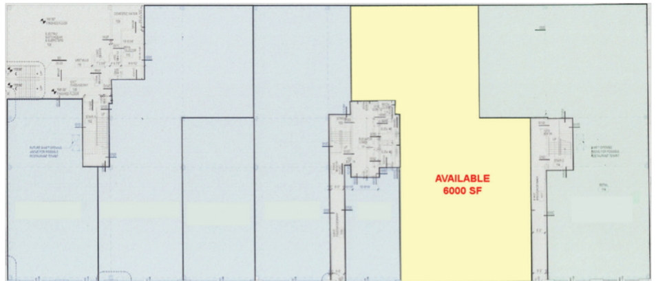
7550 Teague Road / Available 6000 SF